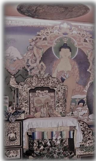
Medicine Buddha and Tara Puja Day